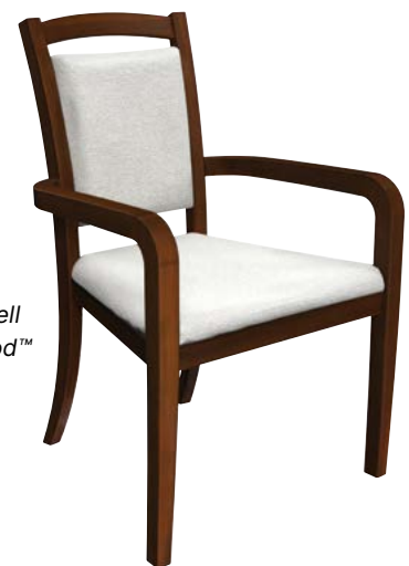
Direct Supply® Maxwell Thomas® BeyondWood™ Salthill Dining Chair

The Direct Supply® Maxwell Thomas® BeyondWood™ Salthill Dining Chair is a classic dining chair with a dark wood frame and a light-colored upholstered seat and backrest.