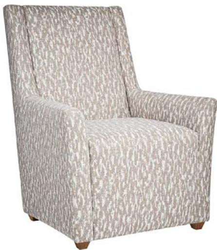
Samuelson Sound Chair

The Deronda Lounge Chair is beautifully designed. It's tailored metal frame and rich, faux-wood finish make it simple yet sleek. This chair is made for long-lasting good looks and dependable use, even in high traffic areas.