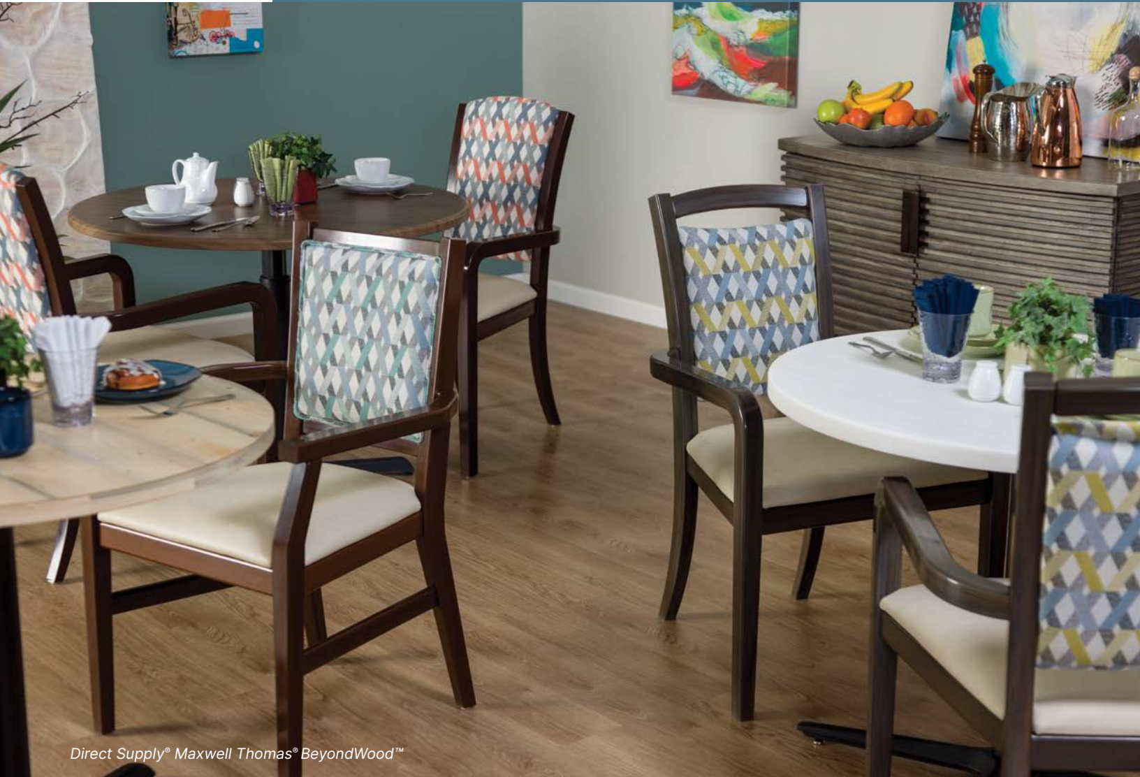
Direct Supply® Maxwell Thomas® BeyondWood™

Refreshing outdated furniture with stylish and functional senior living furnishings can help you attract prospective residents and their families. In addition to increasing marketability, new furniture can help elevate the everyday experience for your residents. We've curated a list of new seating designed for senior living environments that are sure to make an impression in 2024.