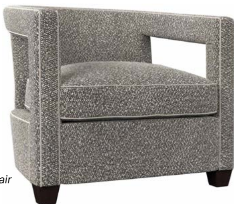
Bernhardt Hospitality Alannis Chair