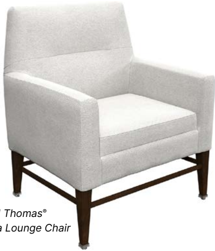
Maxwell Thomas® Deronda Lounge Chair

The new Maxwell Thomas® BeyondWood™ composite dining chairs are the most durable in the Maxwell Thomas dining portfolio, combining strength and comfort for Senior Living Residents. The design and construction of these chairs create a homelike feel without sacrificing the benefits of commercial-grade seating. This chair bridges the natural, inviting feel residents and patients expect with the durability needed for a high-use environment.