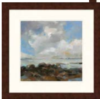
Island Waterways 2, 28"W x 28"H

Complete your office spaces by incorporating attractive artwork. Fresh, inviting pieces make an excellent first impression on potential new residents and their families. Choose your favorite pieces or a full collection.