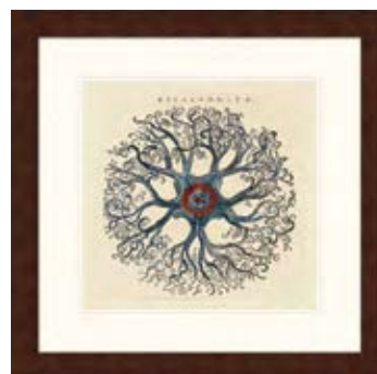
Epigrammata, 28"W x 28"H