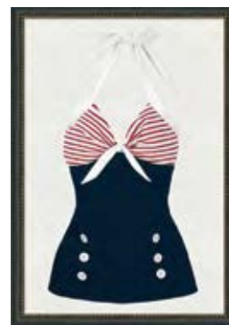
Vintage Swimsuit 8, 21"W x 30"H