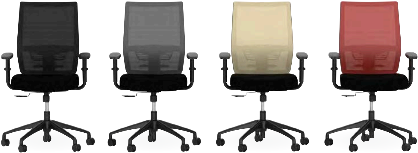
Back Mesh Colors for A & D