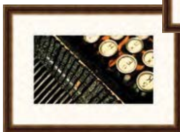
Antique Corona Typewriter, 28"W x 20"H