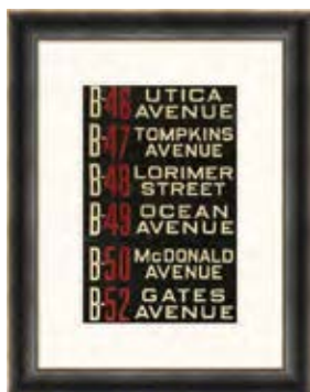
Brooklyn Bus Roll Sign I, 22"W x 28"H