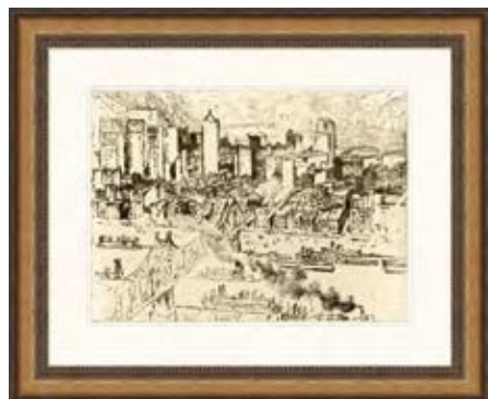
Railway Station, Pittsburg, 34"W x 28"H