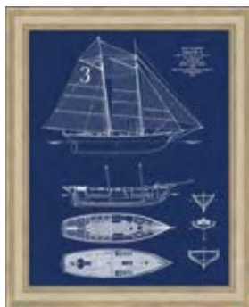
Gracie S., 23"W x 28"H