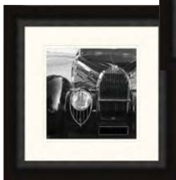
Vintage Contours I, 28"W x 28"H