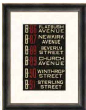
Brooklyn Bus Roll Sign I, 22"W x 28"H