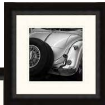
Vintage Contours V, 28"W x 28"H