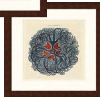
Asterias, 28"W x 28"H