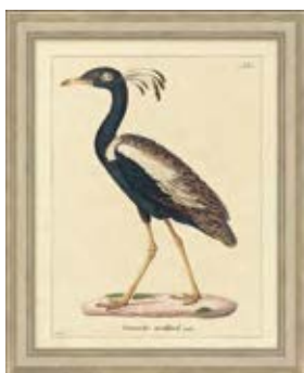
Quaride, 23"W x 28"H