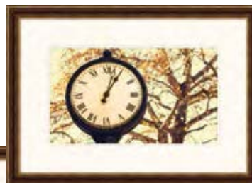
Old Style Clock, 28"W x 20"H