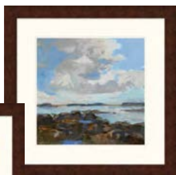
Island Waterways 1, 28"W x 28"H